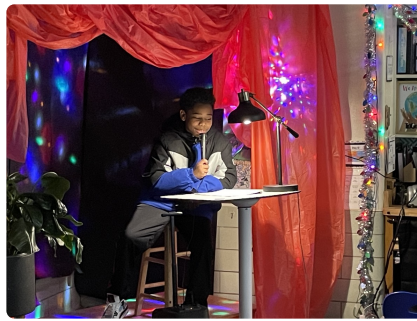
Poetry Cafe is open for business